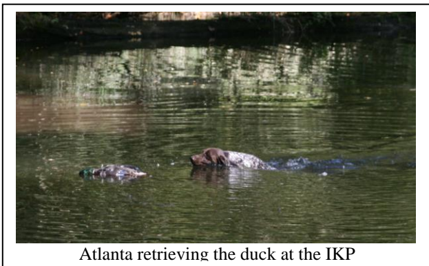
Atlanta retrieving the duck at the IKP